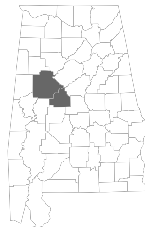
THE SSCC SERVICE AREA, AL