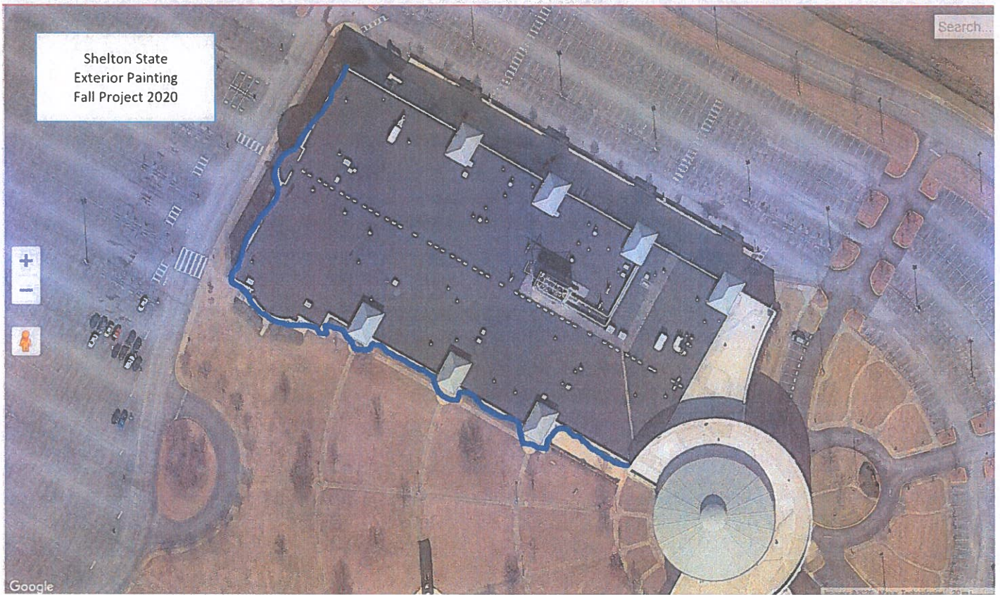
Blue Line represents exterior walls including inside portico entrances all ceilings and over hangs.